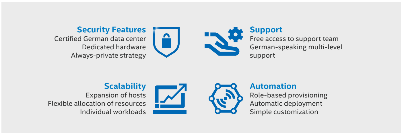
Figure 2. The Managed Infrastructure as a Service (IaaS) solution provides enhanced security, high scalability, technical support and automated processes—all of which help customers focus on serving their own end-customers and increasing revenue.