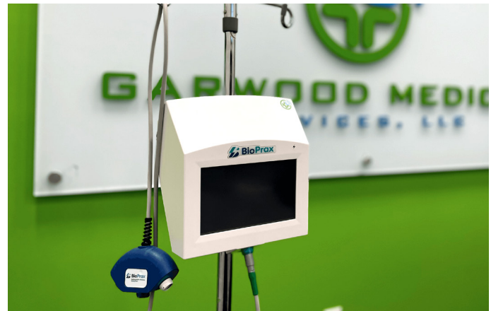
Garwood's BioPrax* device uses DC current to provide protection from infections associated with devices such as the femoral component