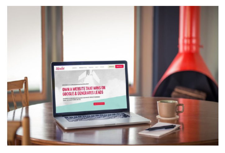
Digital Skyrocket takes advantage of Kinsta's performance to offer their own customers a guaranteed level of responsiveness.

WordPress runs best on processors with high single-core performance. By upgrading hosting services from N1 to C2 instances on Google Cloud, Kinsta's managed WordPress hosting was able to offer all their customers up to 200 percent faster page loads. The faster servers run on 2nd Gen Intel Xeon Scalable processors with high core clock speeds. The new C2 instances offered higher performance, which allowed them to easily scale, running more customers on fewer systems, and allowed them to maintain a leadership position in the market.